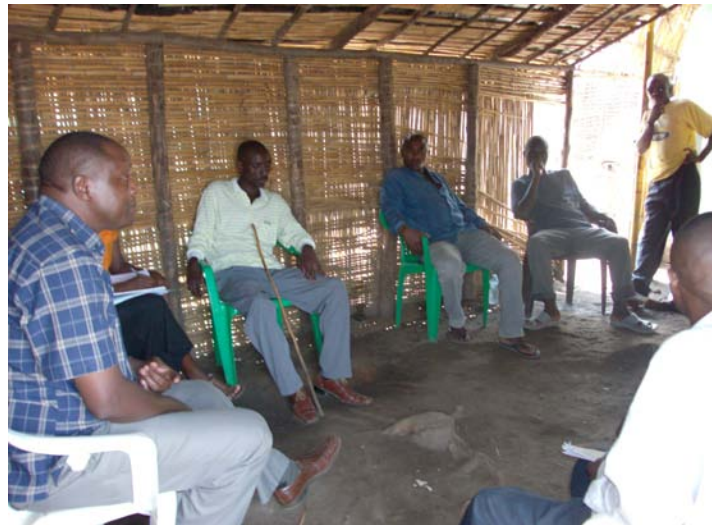
On site capacity development support to community members