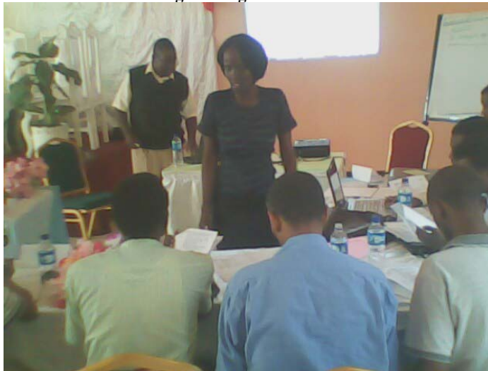
HIPo-Africa staff during training in Ethiopia