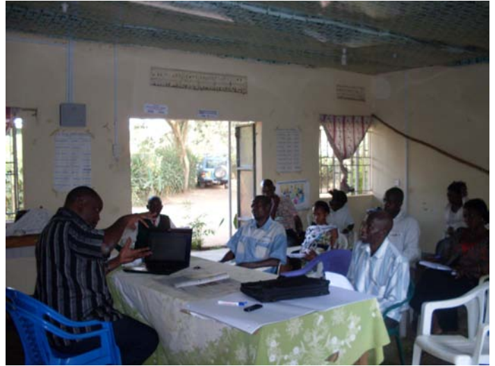
HIPo-Africa staff assessing Community Systems with community leaders in Katwe-Kabatoro town - Kasese District

One of HIPo-Africa staff conducting an Organizational capacity assessment with FADSI team in Rakai