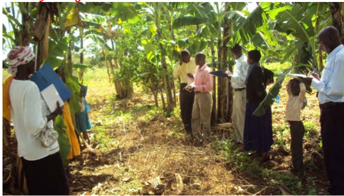
HIPo-Africa staff during training in Rakai